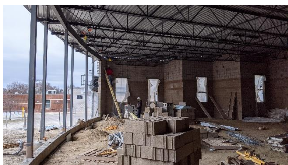
Installation of structural steel columns, roof framing, and decking is complete at the FHS Weight Room Addition.