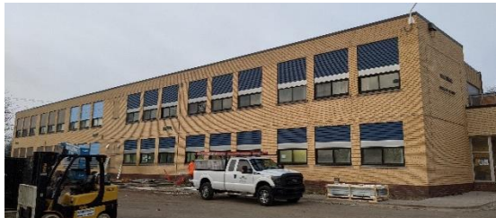
Improvements at the Neigebaur Administration Building include a new Board Room and exterior restorations.

At the Neigebaur Administration Building, exterior façade restorations are complete, including masonry work and new metal wall panels. Inside the building, progress continues on interior renovations including the framing of the walls and soffits in the new District Board Room. The installation of millwork and new finishes throughout the office suites is also underway. We look forward to the completion of these projects in the coming months and the opportunities they will provide to our students and community!