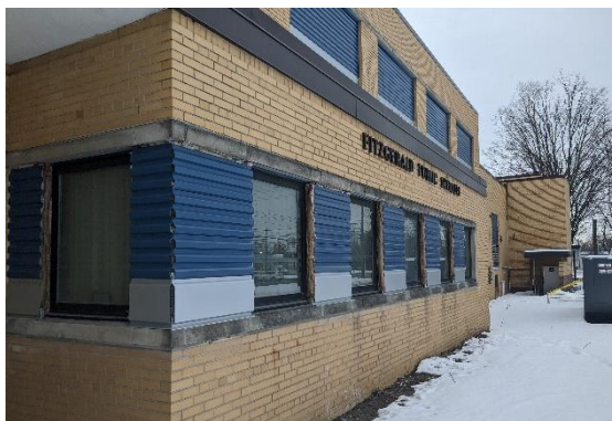
Improvements at the Neigebaur Administration Building include new interior finishes and new metal wall panels to match District colors at the building entrance.