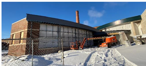
Recently completed work at the Weight Room Addition includes rough mechanical and electrical as well as the installation of interior and exterior door and window frames.