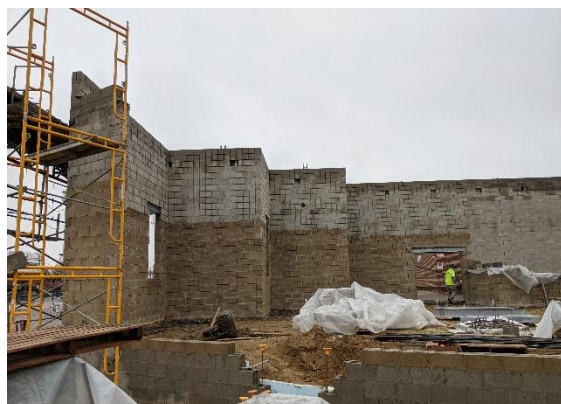
Completion of the exterior masonry walls at the Weight Room Addition will allow for structural steel installation.